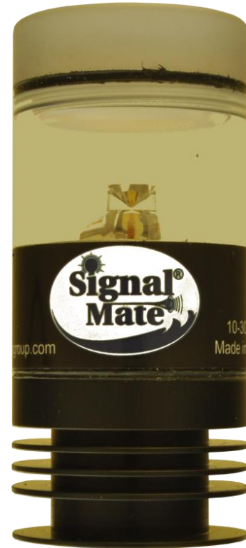
Certified 2NM/3NM ABYC-A16, COLREGS '72

Built for and used by USCG and other Military vessels since 2004.